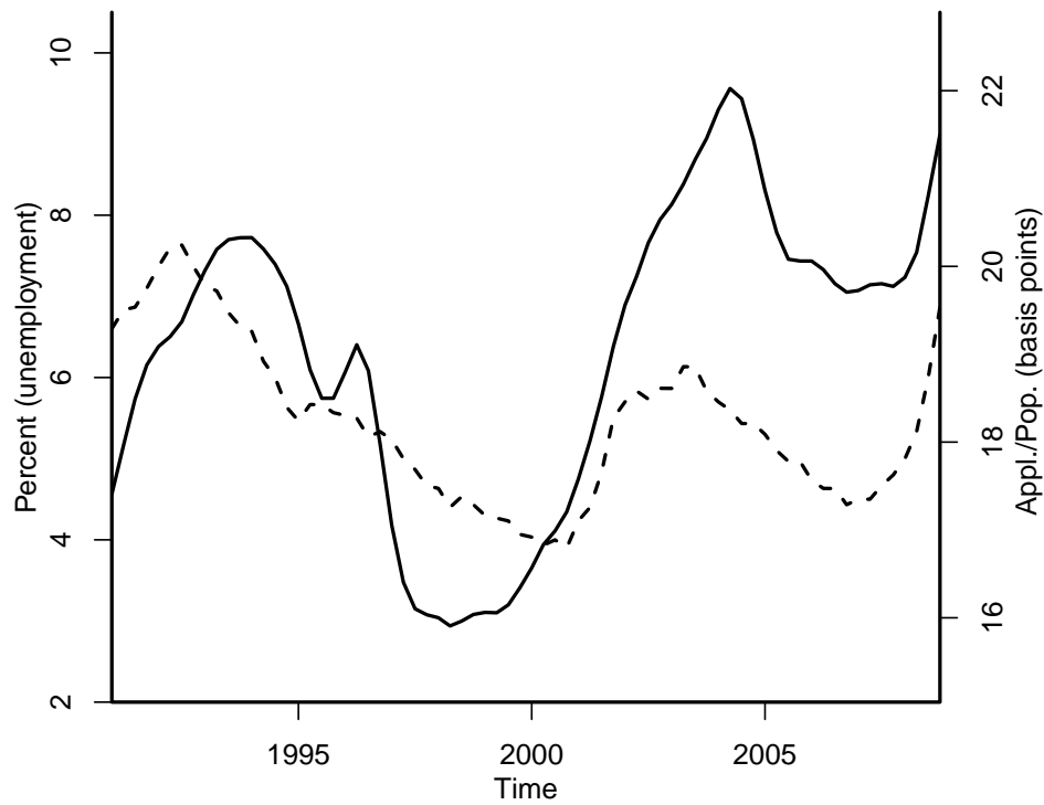
Figure 1: Number of applications for DI and the unemployment rate, 1991-2008

Notes: This figure shows trends in the unemployment rate and applications per population for DI. The unemployment rate (striped line) is expressed in percentage points as shown by the left y-axis. Applications per population for DI (solid line) are expressed as one hundredth of a percentage point, or one part per ten thousand (basis points) as shown by the right y-axis. Population is the number of people age 20 to 64. Both trends are by calendar quarters and seasonally adjusted.